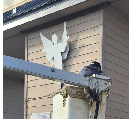
Row 1 Left & Row 2 Right: Millerton UMC decorating for Christmas