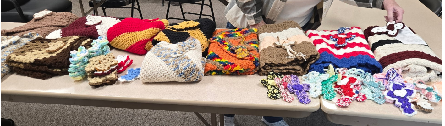
Row 1: Prayer Shawls